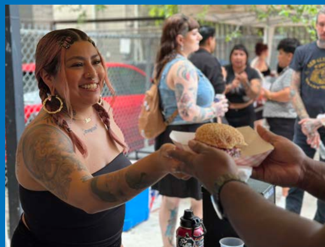
A fun, backyard barbecue with friends and family turned into a wonderful opportunity to “party with a purpose.”