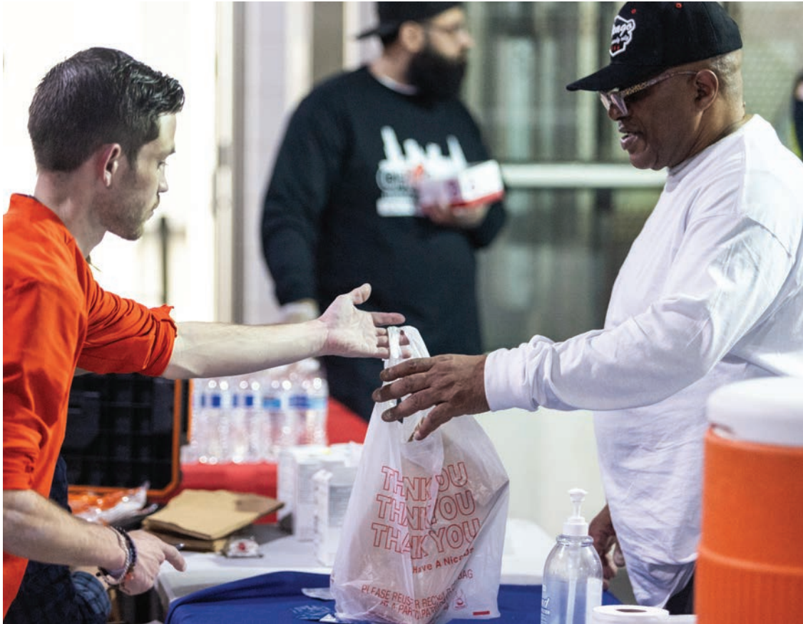
The CTA Outreach program offers free health care, food and more to unhoused CTA riders on the Red and Blue L Lines.