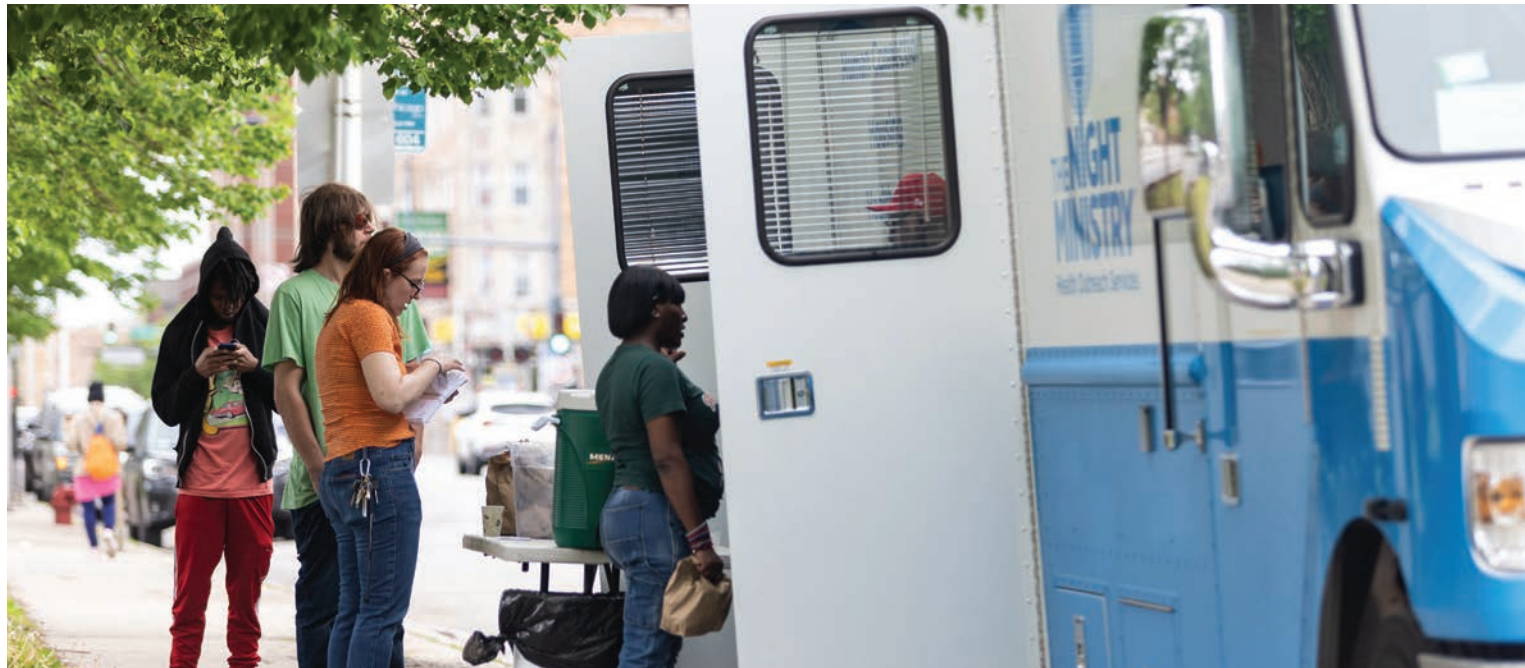
Our Health Outreach Bus visits tent encampments and neighborhoods across the city.