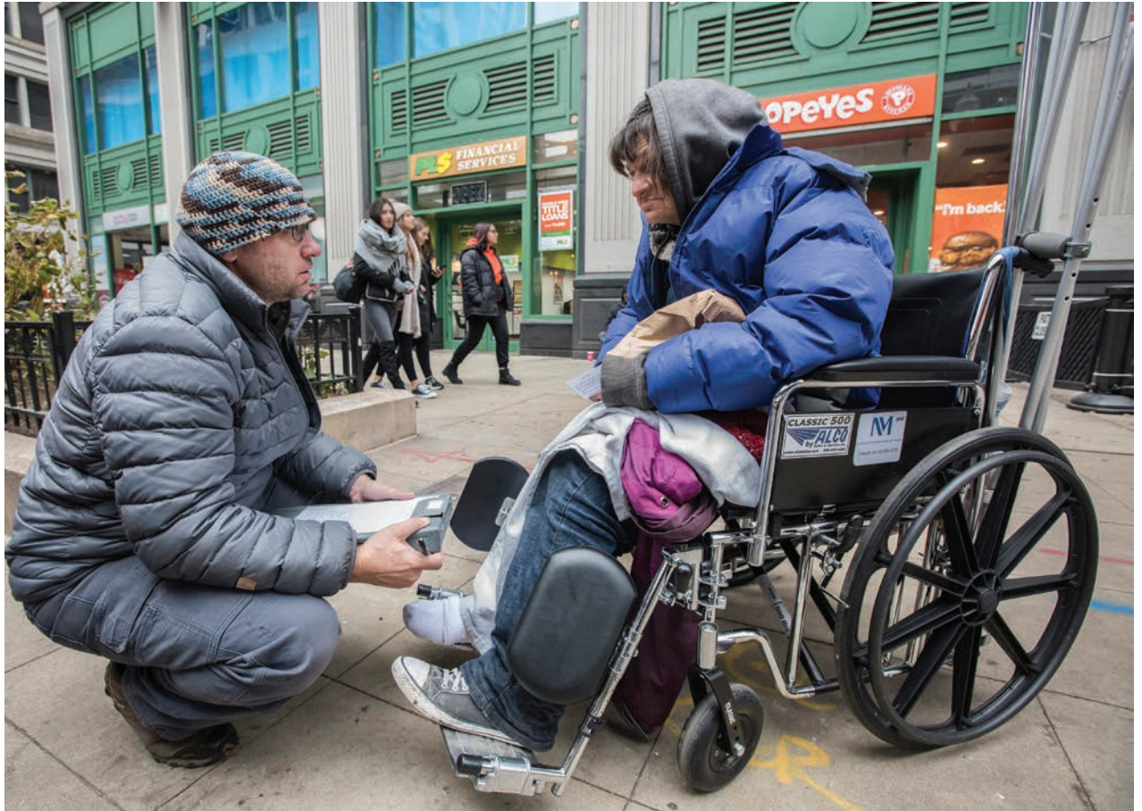
Our Street Medicine Team checks in on a client on Wabash Ave.