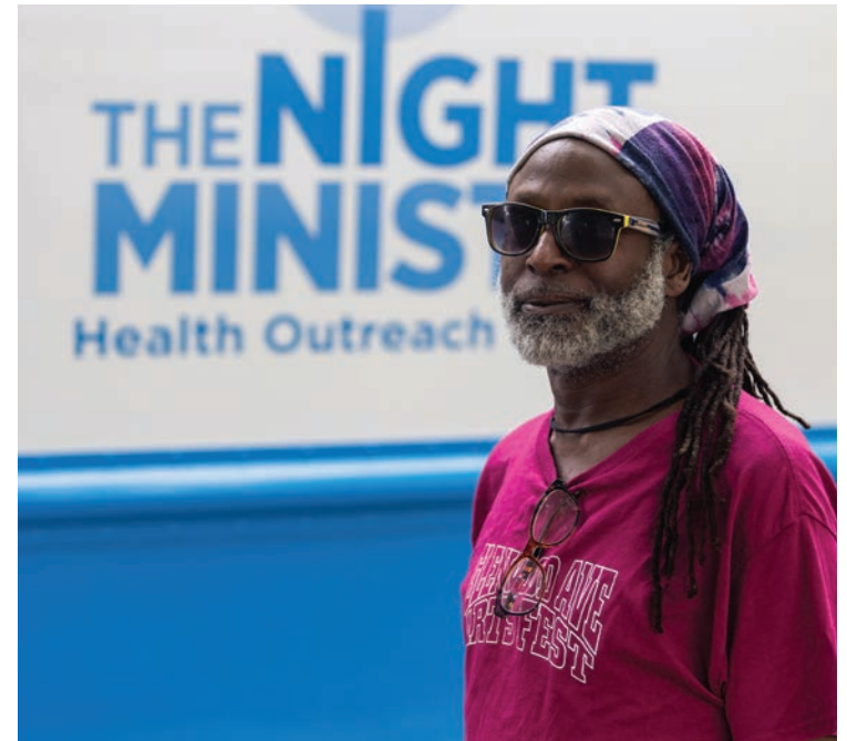
Resources and support are delivered directly to those in need.