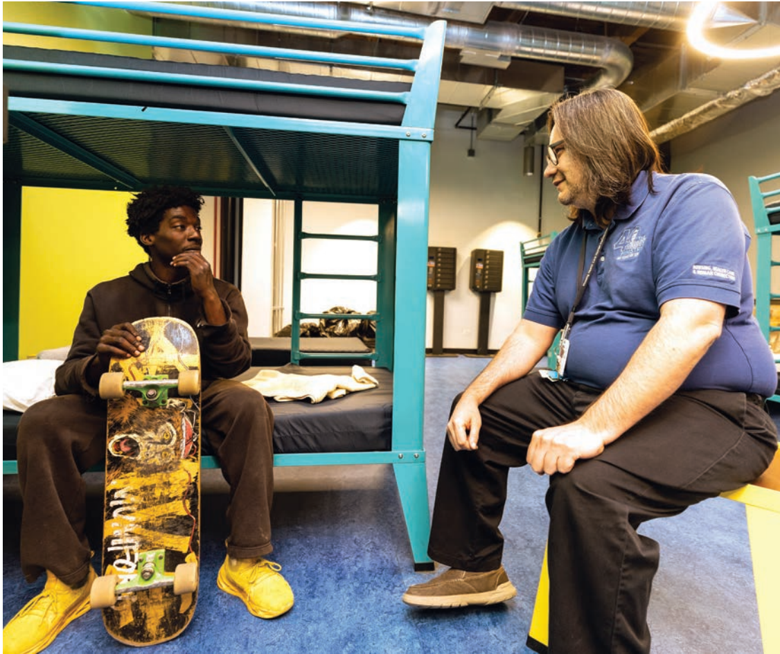
The Crib provides overnight shelter to young adults ages 18–24, coupled with supportive services.