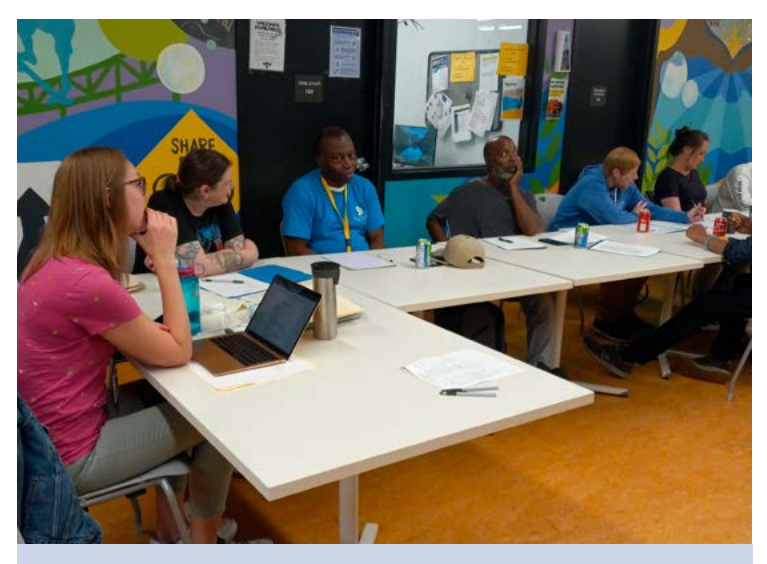
Outreach and Health Ministry Program Client Advisory Board members attend a meeting at The Night Ministry's headquarters.

Members determine the types of projects they would like to take on. And they are paid an hourly rate for their time, expertise, leadership, and service to the agency. The Night Ministry also