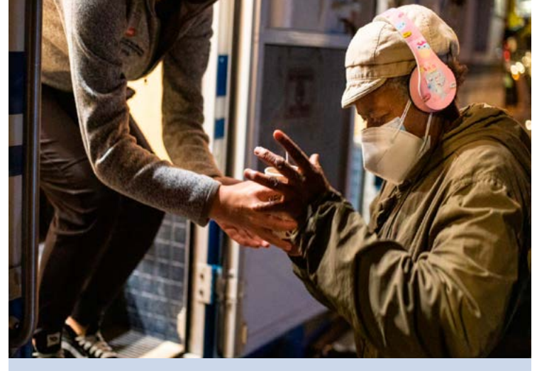
A Health Outreach Bus visitor accepts a cup of coffee from a volunteer in the Humboldt Park neighborhood.

Assisting on the Health Outreach Bus: Volunteers at the Health Outreach Bus help fulfill a core component of the agency's mission—human connection. They join staff at the Bus stops to chat with community members and serve refreshments and food, helping to build a comfortable and welcoming environment for visitors.