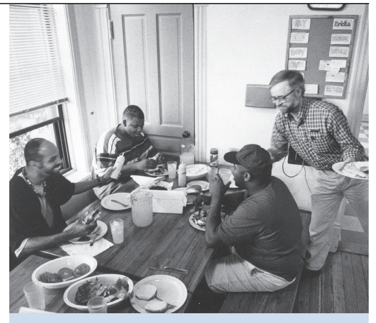
Residents and staff enjoy a meal together at The Night Ministry's first youth shelter in Lakeview.

and did his intake I realized, 'Hey! It's working. We have our first resident!'"