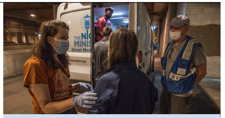
The Night Ministry's Street Medicine Team assisting clients along Lower Wacker Drive.

Over Street Medicine's young life, it has steadily grown from serving one day a week to six. Not only has the schedule expanded, but staff has increased to include a full-time Case Manager, a Nurse Practitioner, a Substance Use Advocate, a Peer Support