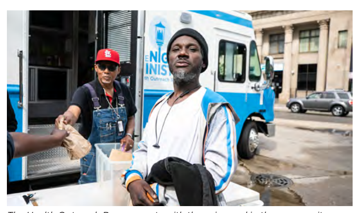
The Health Outreach Bus connects with those in need in the community

To ensure the Bus program has the greatest impact possible, we have shortened our initial bus stops to one hour and have shifted the remainder of the time to focus on encampments.