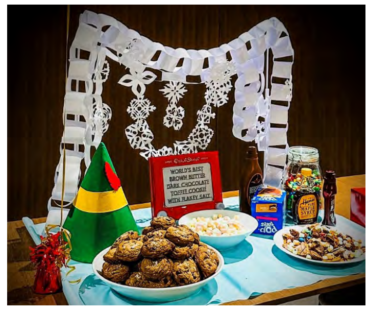
Holiday treats from the annual Bakeoff

The event featured 24 bakers from local architecture & design firms, project managers and general contractors, who created an array of delicious and visually stunning cookies. A panel from the renowned Alliance Bakery judged the cookies on taste and presentation, while attendees had the chance to vote for the "People's