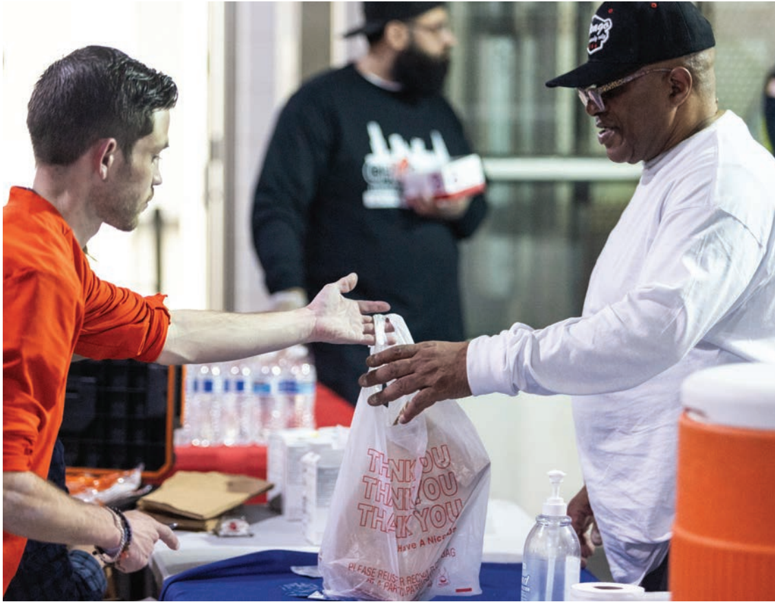
The CTA Outreach program offers free health care, food and more to unhoused CTA riders on the Red and Blue L Lines.