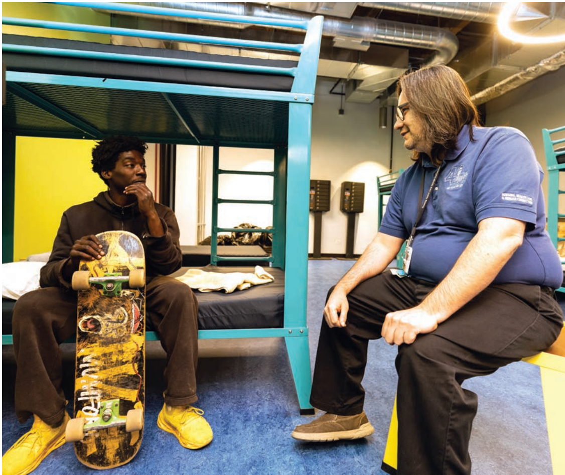
The Crib provides overnight shelter to young adults ages 18-24, coupled with supportive services.