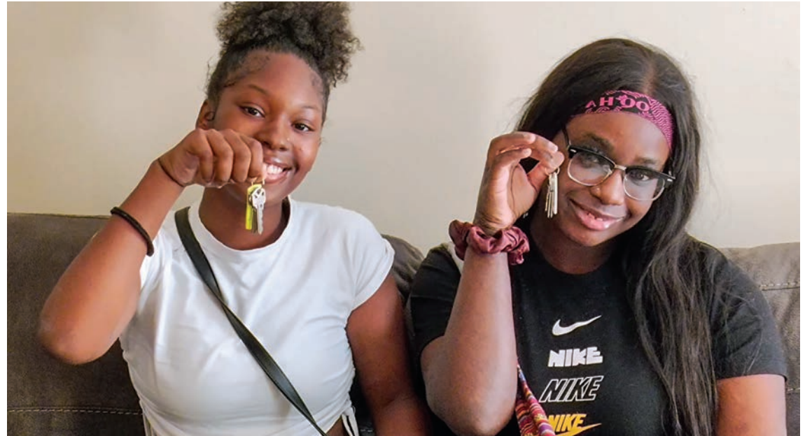
Our hybrid Pathways program offers apartments or group housing for young adults ages 16-24 for up to 2 years.