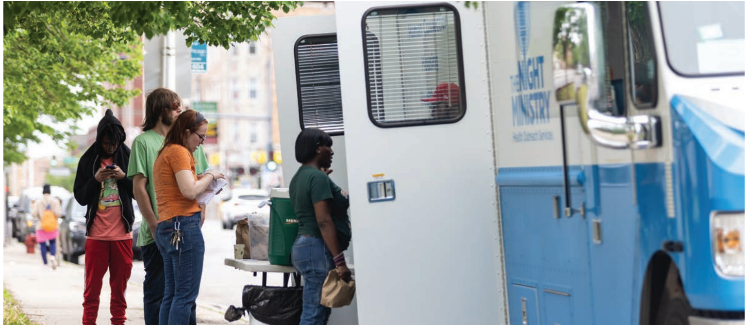
Our Health Outreach Bus visits tent encampments and neighborhoods across the city.