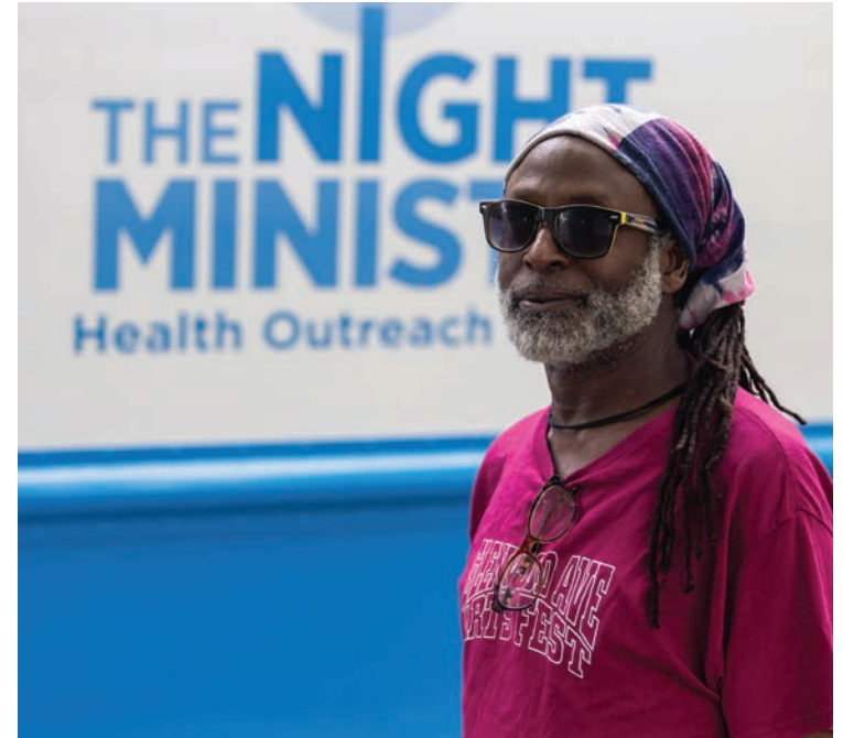
Resources and support are delivered directly to those in need.