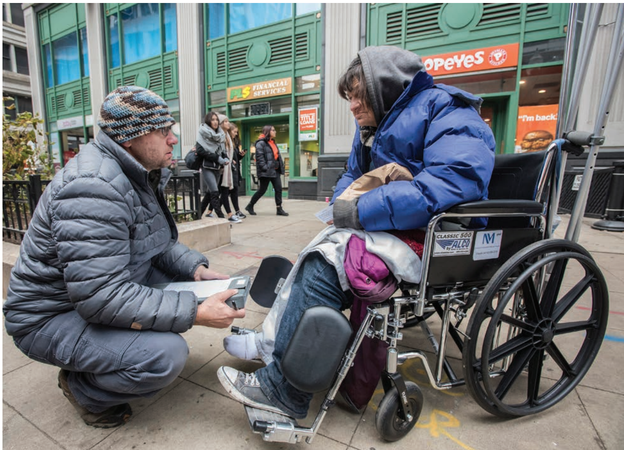
Our Street Medicine Team checks in on a client on Wabash Ave.