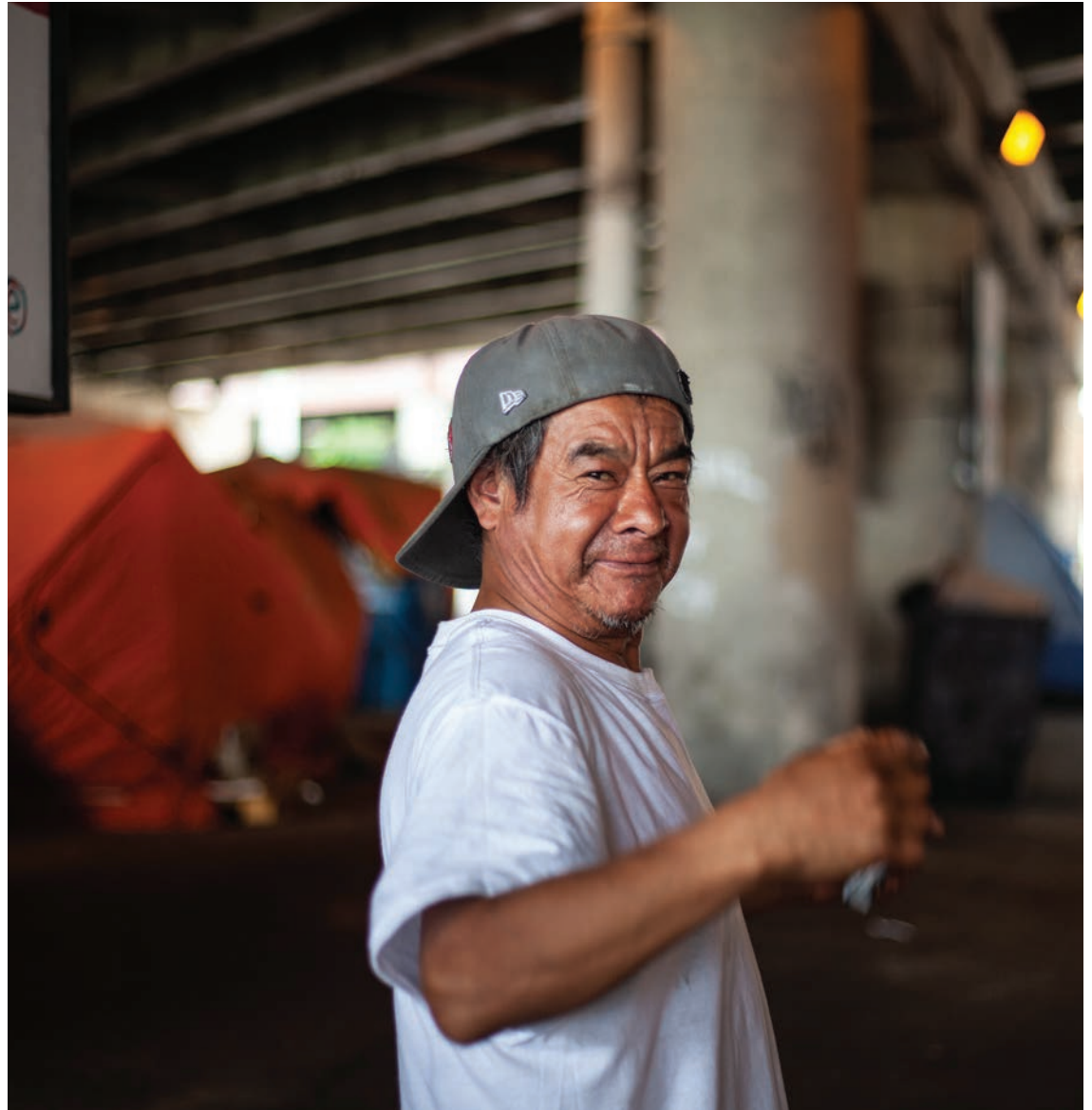
The Night Ministry compassionately accepts each individual as they are and works alongside them for their immediate physical, emotional and social needs.

The Sondheimer Family Charitable Foundation The Speiser Family Foundation The Spencer Foundation The Standard Insurance Company The WaterWheel Foundation Theodore Eckert Foundation Therese Foundation Thomas Family Foundation Thrivent Financial —Thrivent Choice Program Tides Foundation TJM Brokerage Toyota Financial Savings Bank U.S. Department of Health & Human Services U.S. Department of Housing & Urban Development Venable Foundation Village Tap Vistex Vizient VNA Foundation W. Clement & Jessie V. Stone Foundation W.P. & H.B. White Foundation Walter and Caroline Sueske Charitable Trust Washingtonian Health Care Foundation Watson on Taxes William and Wilma Dooley Foundation William R. Johnson Family Foundation