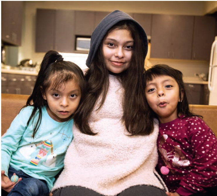
Our Parenting with Purpose program provides long-term housing for pregnant or parenting young mothers ages 16-22 and their children in a nurturing environment

Immanuel Evangelical Lutheran Church, Chicago Kenilworth Union Church Luther Memorial Church, Chicago Mary, Seat of Wisdom Parish, Park Ridge Morton Grove Community Church Northbrook United Methodist Church Northminster Presbyterian Church, Evanston Our Saviour's Evangelical Lutheran Church, Arlington Heights Plymouth Congregational UCC, Burlington, WI Presbyterian Church of Western Springs Queen of All Saints Basilica, Chicago Ravenswood United Church of Christ, Chicago Redeemer Lutheran Church, Hinsdale Southminster Presbyterian Church, Arlington Heights St. John's Evangelical Lutheran Church, Wilmette St. Pauls United Church of Christ, Chicago Union Church of Hinsdale Unitarian Church of Evanston Women's Association of Glenview Community Church Yorkfield Presbyterian Church, Elmhurst