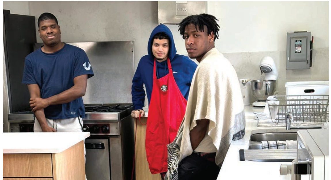
The Interim Housing program provides housing and support for young people ages 14-20 for up to 4 months.