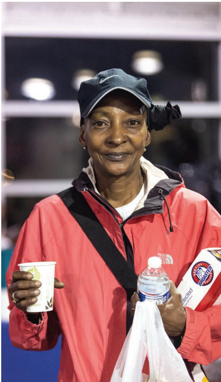
Our Street Medicine Team develops trusting relationships.