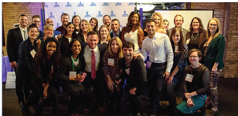
In 2017 The Night Ministry's Associate Board exceeded its fundraising goals for Night Lights, its annual gala.

The Associate Board (AB) supports the overall mission and activities of The Night Ministry. Acting as ambassadors of the agency, Associate Board members engage the community through volunteering, fundraising, networking, and advocacy opportunities targeted towards young professionals. To join the Associate Board or to receive information about membership, email associateboard.tnm@gmail.com . ♦