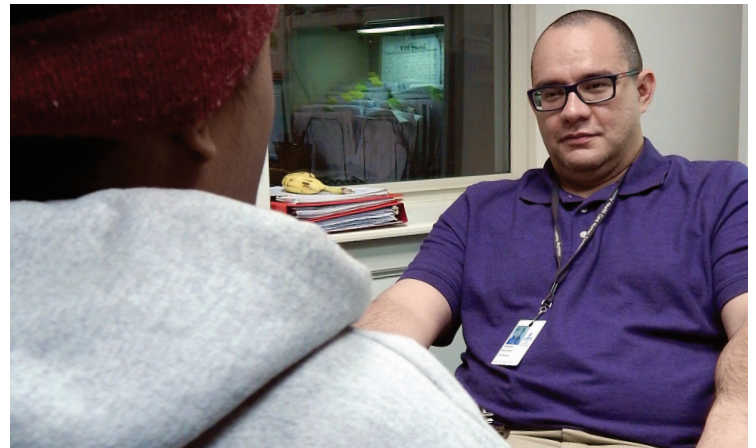
The Night Ministry provides Youth Programs staff with resources to help young people experiencing mental health issues.

West Town staff said the services offered with Rush, which are expanding to The Night Ministry's Response-Ability Pregnant and Parenting Program (RAPPP), have resulted in a decrease in symptoms and an increase in client motivation.