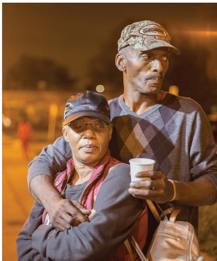
Individuals experiencing homelessness often face multiple hurdles as they pursue permanent housing.

An individual without a reliable income might stay in an emergency shelter while trying to secure an income through employment or government benefits, Rodriguez said. But living in a shelter can present its own set of complications.