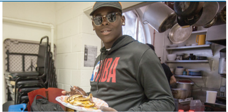
The Crib provided safe, warm shelter for 23 young adults experiencing homelessness while operating continuously during a dangerously cold stretch of days this past winter.