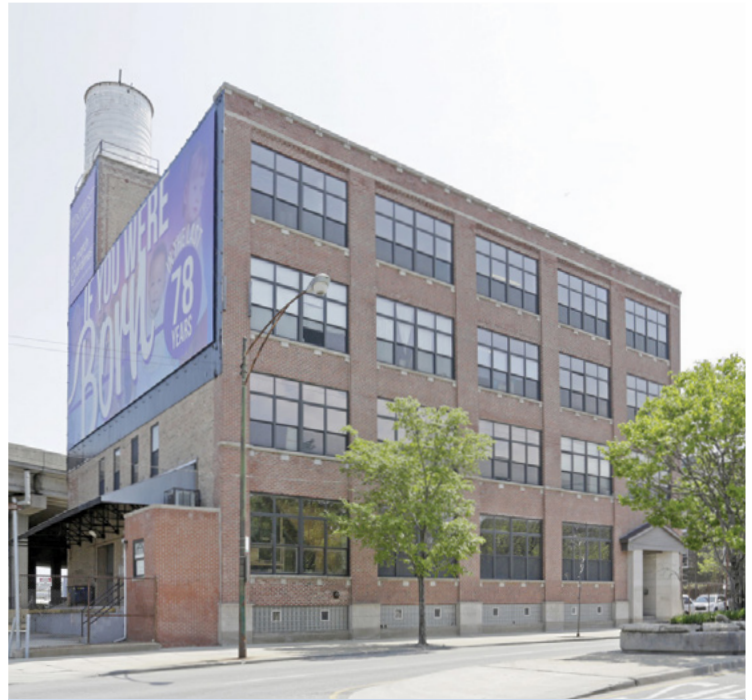
The Night Ministry plans to relocate The Crib, Outreach and Health Ministry staff, and central office to 1735 North Ashland.